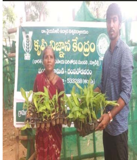
Technology Spread through KVK, Pandirimamidi