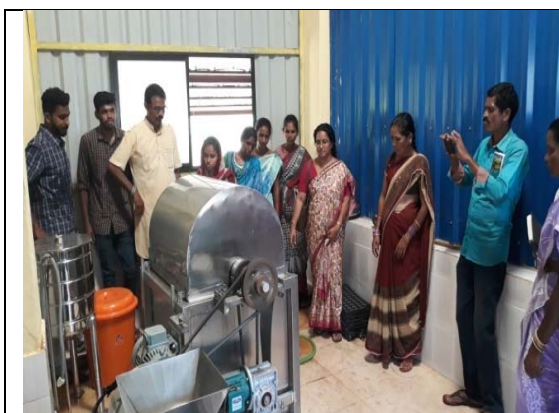
Demonstration of mechanical washer cum peeler for ginger