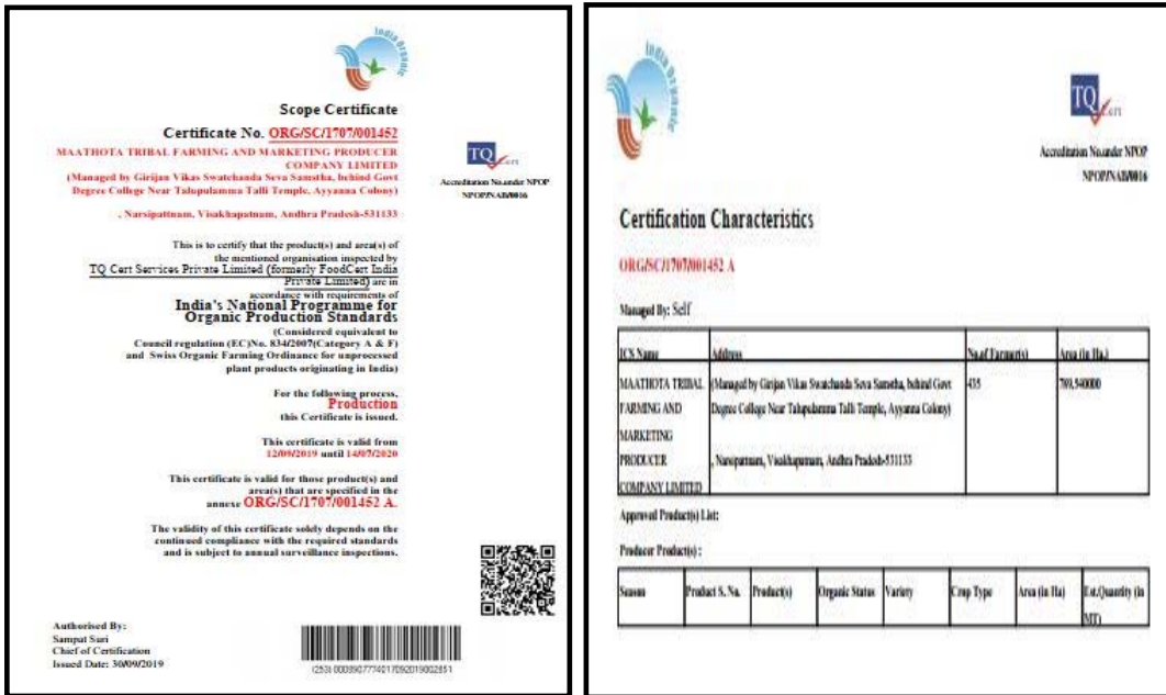
Fig. 15 Organic Certification Certificate issued by TQ Cert Services