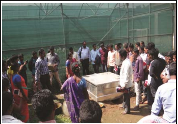
Conducted demonstrations on usage