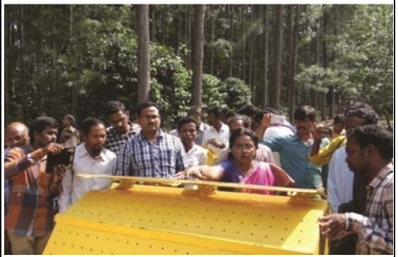
Conducted demonstrations on usage of turmeric polishers