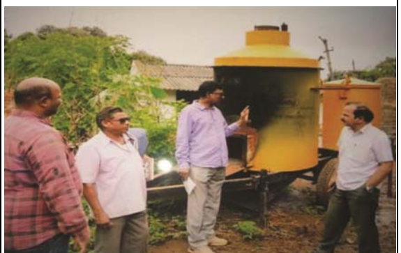
ITDA distributed turmeric polishers and boilers