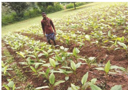
Fig. 12 Monitoring of Turmeric var. Roma and IISR Pragathi cultivating fields

Agency (ATMA) number of trainings are given at HRS, Chintapalle and exposure visits organized during various stages of the Roma crop such as seed treatment, bed preparation, sowing, mulching, organic manure preparation & application, harvesting, boiling, drying and polishing. Due to these continuous endless efforts, tribal farmers from Chintapalle and G.K.Veedhi have expressed their interest to cultivate the var. Roma.