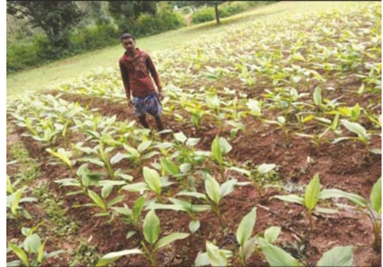
Fig. 13 Cultivation of turmeric on raised bed method instead of flat bed method