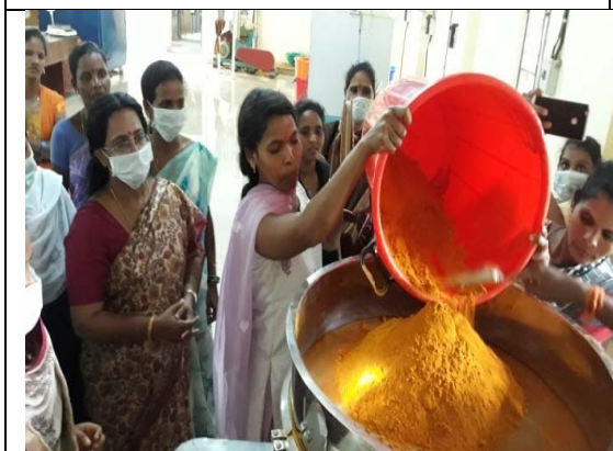
Use of mechanical sifters