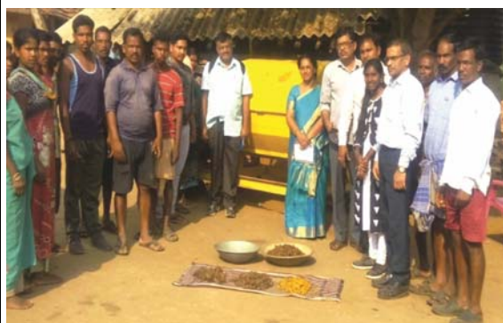
Usage of turmeric boilers and polishers by tribal farmers