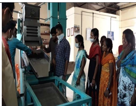
Demonstration and use of cleaner cum grader for black pepper