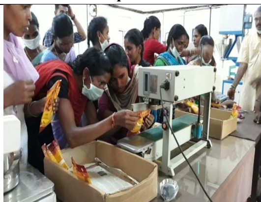
Use of sealing machines