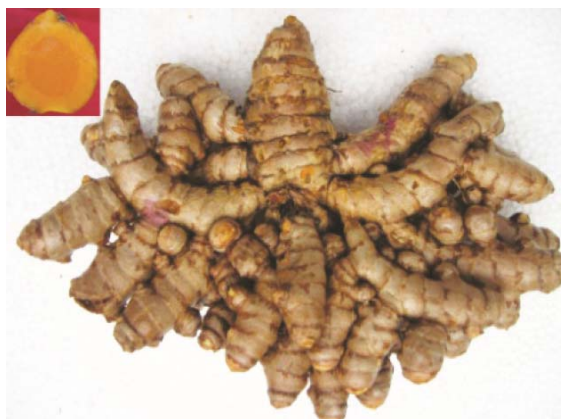
Fig. 6 Rhizome of Roma (8 months after sowing)