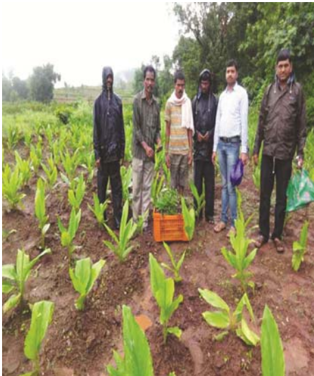
Technology Spread through BCT-KVK, Yelamanchili