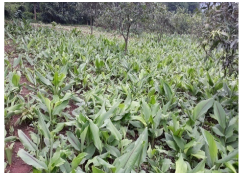
Fig. 3 Traditional system of flat bed cultivation (mixing of seeds and inadequate plant population)