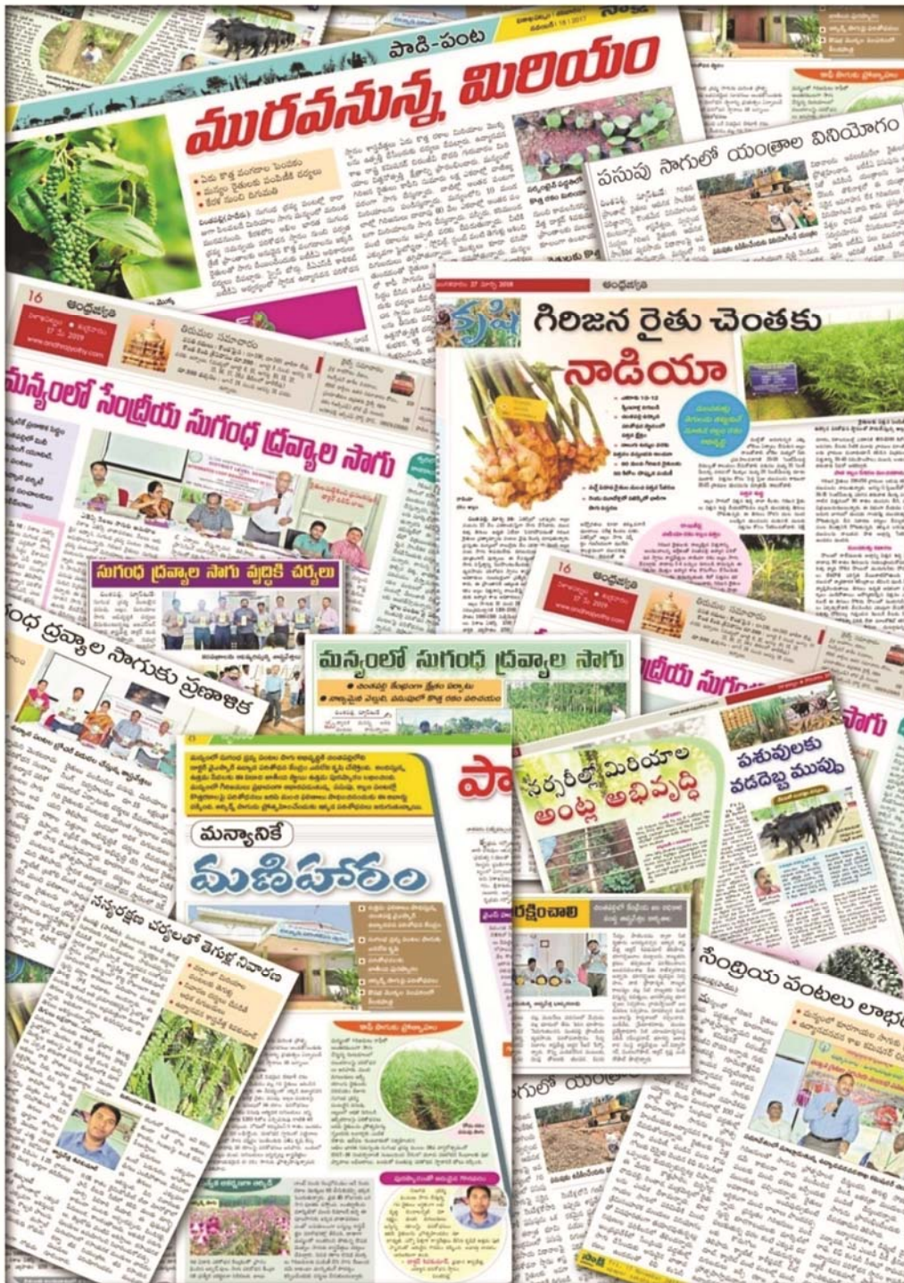
Fig. 20 Media coverage of various activities