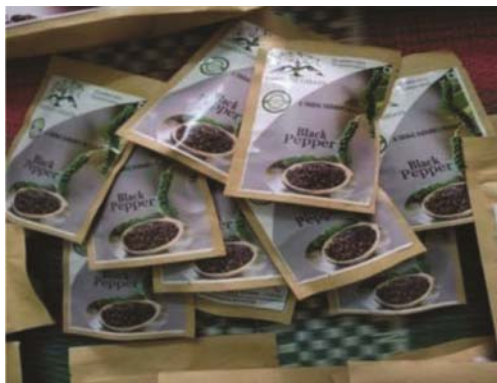
Black pepper powder