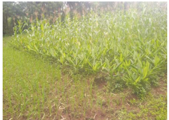
Fig. 16 Inter cropping of turmeric with maize