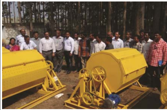
Distribution of turmeric polishers to FPOs