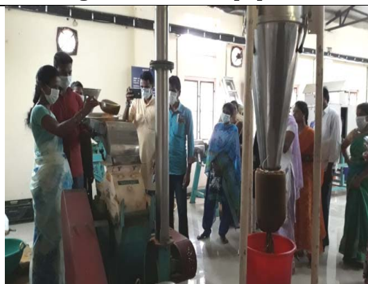
Hands on training on pulverising spices