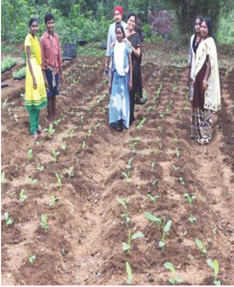
Technology Spread through SERP