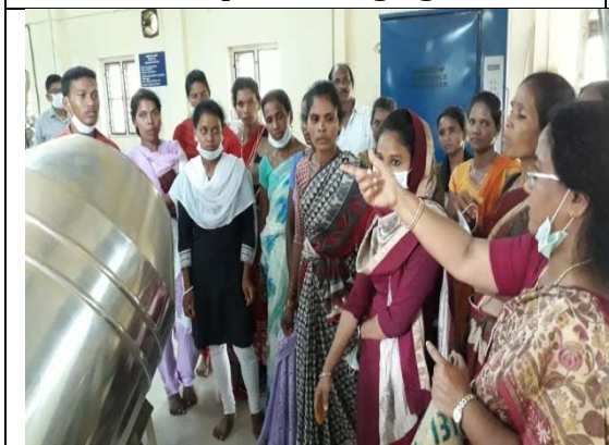
Demonstration of spice roaster