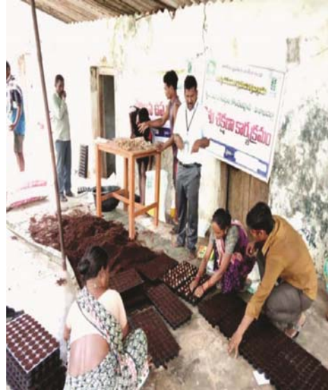
Technology Spread through KVK, Kondempudi