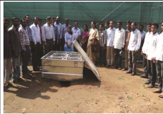
Distribution of turmeric boilers to FPOs