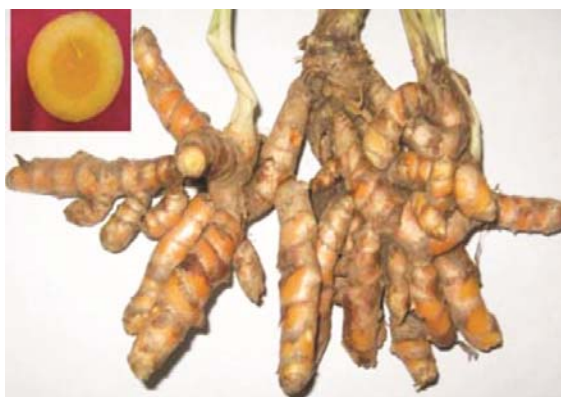
Fig. 5 Rhizome of Chintapalle Local (20 months after sowing)

Surveys were conducted by a multi disciplinary team consisting of representatives from ICAR-IISR, AICRPS Chintapalle, SERP and Tata Trust. The bench mark information pertaining to the formation and composition of turmeric FPO's, existing spice cultivation and yield profile were collected. Based on the data, a SWOT analysis results was carried out and presented in Table 6.