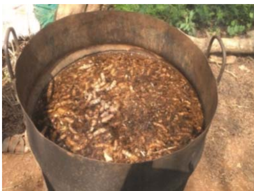
Fig. 4 Traditional system cooking turmeric