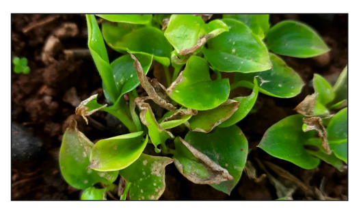
Nursery leaf spot