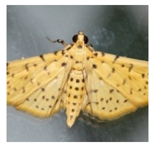
Shoot & capsule borer adult moth