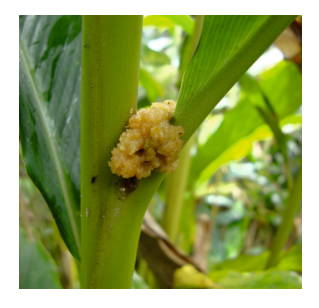
Shoot borer infestation on cardamom pseudostem

The shoot and capsule borer is a serious pest in nurseries as well as in the main plantations. The larvae bore into pseudostems and feed on the internal contents leading to the formation of 'dead heart' symptom. When panicles are attacked, the portion ahead of point of entry dries off. The larvae also bores into the capsules and feed on the seeds resulting in empty capsules. The pest is prevalent throughout the year but higher incidence is noticed during the months of January-February, May-June, and September-October.