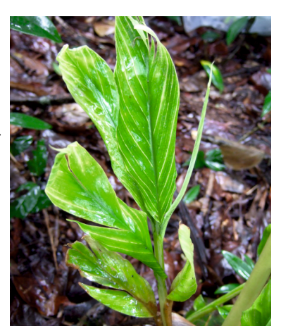
Kokke kandhu symptoms

The virus is not transmitted through seed, soil, mechanical means, contact between roots, and farm implements. The primary source for infection includes infected clones while the secondary spread within the plantations is through the cardamom aphid, P. caladii .