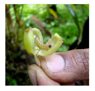
Shoot & capsule borer larvae