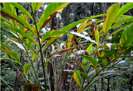
Leaf blight severity