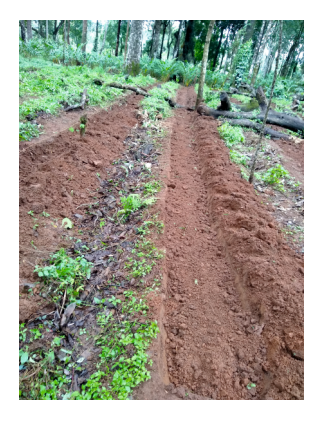
Trench for clonal multiplication of cardamom

better establishment of the suckers, irrigation may be given once in a fortnight. Apply fertilizers @ 48:48:96 g NPK per sucker in 2-3 splits starting from two months after planting. Neem cake @ 100-150 g/plant may also be applied during planting. About 15-20 good quality planting units could be produced from a mother clump within ten months of planting.