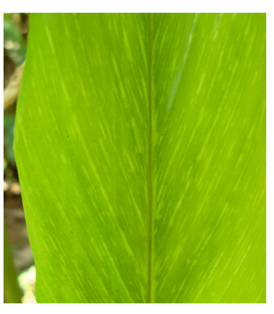
Chlorotic streak symptoms on leaf

Most characteristic symptom of the disease is continuous or discontinuous spindle shaped yellow or light green streaks on leaves intravenously and along the midrib, which later coalesces so that the veins turn yellow or light green in colour. Discontinuous spindle shaped mottling appears on the pseudostem and also on the petioles. In severe cases, tillering in infected plant is suppressed. The distinguishing feature of