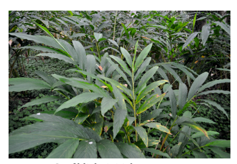
Leaf blight initial symptoms

Leaf blight ( Chenthal ) is caused by the fungus Colletotrichum gloeosporioides . The disease assumes severity during the post-monsoon period. The disease initially manifests on the leaves as water-soaked lesions which later coalesce to form yellowish-brown to reddish-brown patches and subsequently withers off. In the advanced stages, several such lesions develop on young and older leaves, which eventually dries up and gives a burnt appearance to the plants.