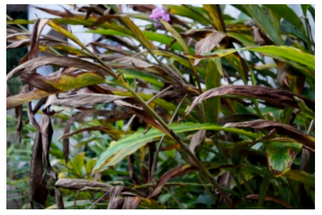
Leaf blight severity