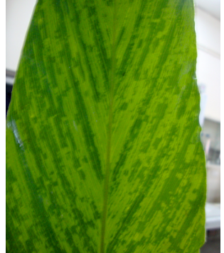
Katte symptoms on leaf

The disease is not transmitted through seed, soil, contact between roots, or through manual operations. The primary spread of the virus occurs through infected plants, while the secondary spread within the field is through the aphid, Pentalonia caladii .