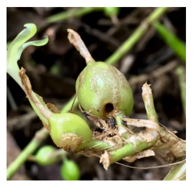
Bore hole on the capsule