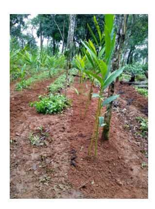
Planting in trenches