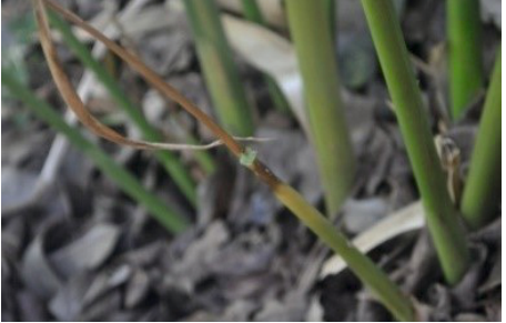
Shoot fly larvae