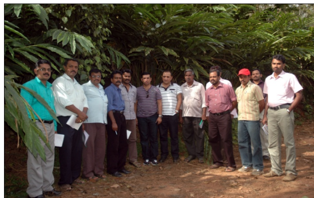
Cardamom Research Centre, Appangala.

September 2010. Following this another media visit was organized on 30 October 2010 to the farms of four farmers of Kodagu district in Karnataka, who had taken up technology management and advisory services from