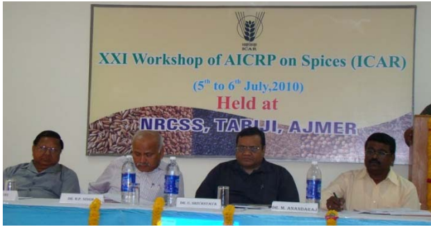
AICRPS in progress

One variety of fennel RF-145 from SKN College of Agriculture, Jobner, Rajasthan was considered for National release, to the States of Rajasthan, Gujarat, Uttar Pradesh, Haryana and Bihar. New technologies identified for transfer to extension agencies included management of Phytophthora foot rot in black pepper and management of soft rot in ginger under both organic and inorganic farming systems; management of blight and wilt of cumint; production technology for fennel, coriander and fenugreek using Rhizobacteria and technology for off-season production of coriander during summer.