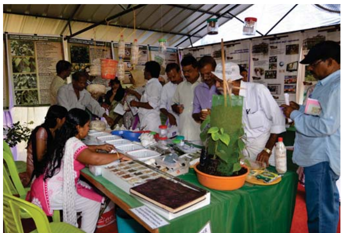
A view of KVK stall in one of the exhibitions