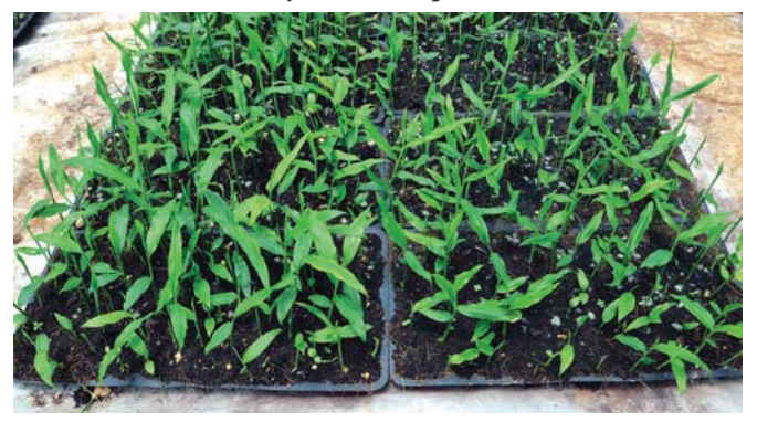
Ginger seedlings raised using on-farm compost in Pro-tray