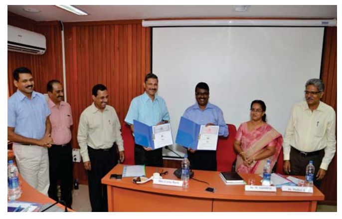
A snap shot of signing of MoU by ICAR-IISR Director and KITCO representative

ICAR-IISR has entered into a Memorandum of Understanding with Kerala Industrial and Technical Consultancy Organization Ltd. (KITCO) on 31 March 2015 in an effort to jointly promote entrepreneurship development. IISR is planning to provide pre-incubation training, market potential studies etc. to the aspiring entrepreneurs through KITCO.