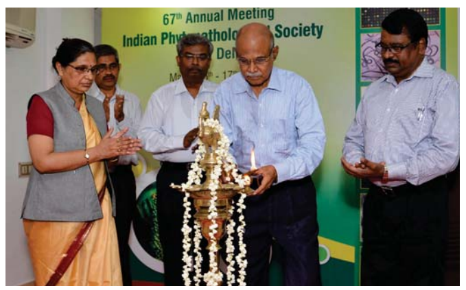
Dr. Y.R. Sarma, FAO Consultant, inaugurating the National Symposium

The symposium recommended the need for strict enforcement of bio-security and domestic quarantine in plant material movement. The forum also felt the need for certification of nurseries engaged in planting material production. It was also decided to convey the need to delineate bio-control from the purview of Central Insecticide Board as a chemical pesticide. Creation of a national database of plant pathogens, more extensive technology demonstration and skill enhancement for plant protection scientists shall be given priority in the activities of the society in the coming years.