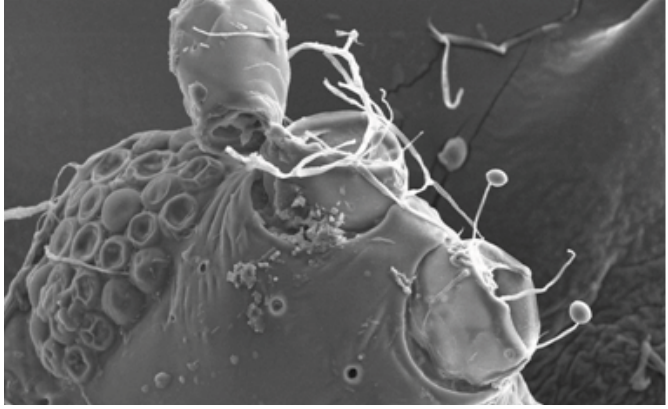
Scanning electron micrograph of infected cardamom thrips