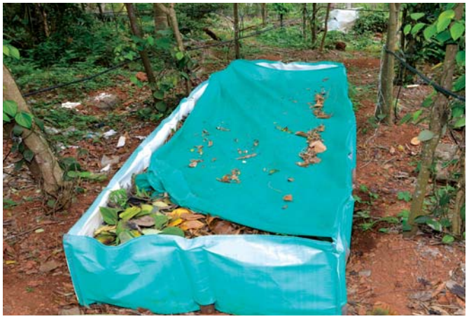
Readymade compost bin

Composting is an integral part of ICAR-IISR farm activities for effective recycling of organic waste, besides keeping premises neat and clean. The leaf fall from avenue trees and farm wastes are regularly converted into valuable manure. Both conventional compost pit and readymade compost bin (3.0 m x 1.0 m x 0.5 m) made with plastic sheet are placed at convenient locations for making compost. On an average 2.0 tonnes of compost is produced annually and used for potting mixture in the nursery.