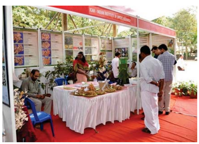
A view of one of the exhibitions organized by ICAR-IISR