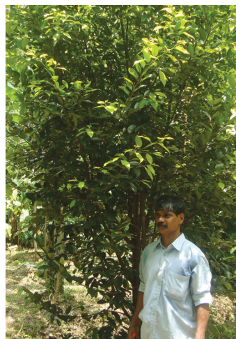
Compact canopy type nutmeg collected from Idukki

participatory germplasm collection undertaken in Thrissur, Kottayam and Idukki districts of Kerala. A rare nutmeg type with compact erect canopy was also collected from Idukki district.