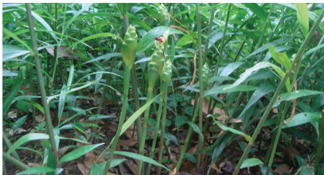
Putative wild type of Z. officinale

Eighteen nutmeg accessions, an equal number of cultivated black pepper accessions and a putative wild type Zingiber officinale were collected during a recent farmer