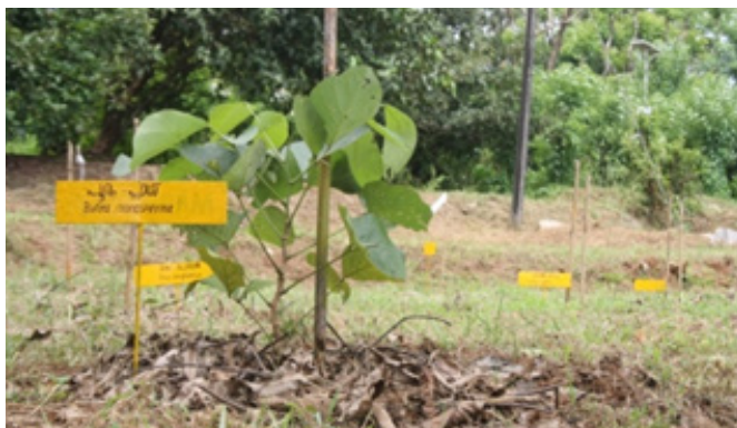
Butea monosperma ('Plas') of Pooram star in the Nakshathra vanam

calendar were planted with saplings supplied by the Kerala Forest Department.