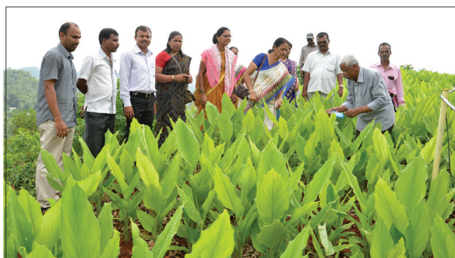
Field visit of trainees