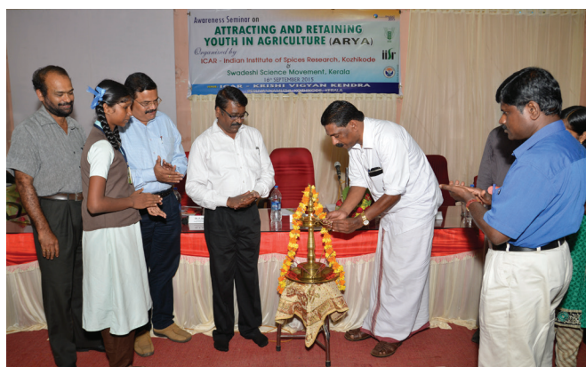
Inauguration of ARYA seminar