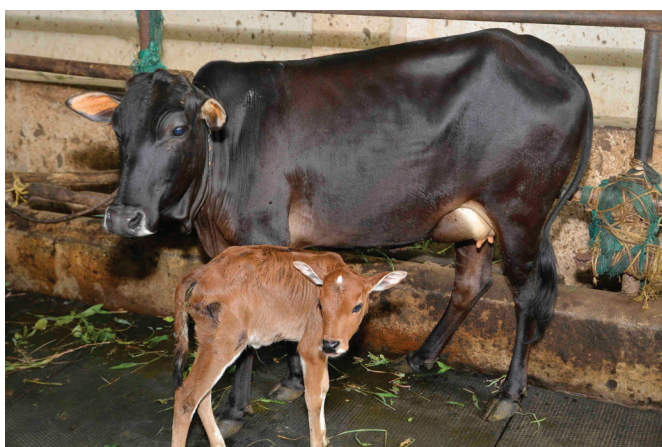
Kasaragod dwarf cow and calf

As a part of network project on organic farming funded by Indian Institute of Farming System Research (IIFSR), Modipuram, a farming system unit with spices (turmeric), milch animals, fodder crops (Hybrid Napier grass, CO-3, CO-4, Congo signal grass and DHN-6) as well as vegetables is established at Chelavoor Campus of ICAR-IISR. The dairy unit established with the technical collaboration of ICAR-KVK, Peruvannamuzhi comprises of two Jersey cross bred cows and a desi breed (Kasaragod dwarf).