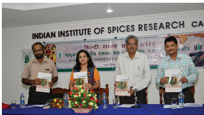
Release of Masaloon Ki Mehak during Valedictory function