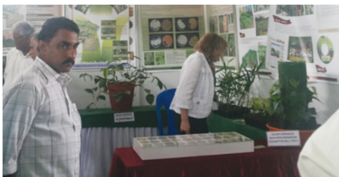
Curious foreign visitor (right) at IISR exhibition stall

Participated in the exhibition on Plantation and spices technologies organized in connection with III International Symposium on Phytophthora held at ICAR-IIHR, Bengaluru during 8-10 September 2015.