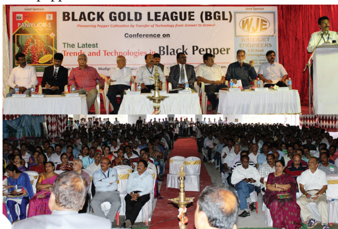
Dignitaries (above) and farmers (below) at the BGL seminar

Delivered a lecture on the role of IISR in developing black pepper technologies and the global pepper scenario in Black pepper seminar organized by Krishika and BGL at Mudigere on 22 August 2015. Over 1000 planters participated and a good feedback on the use of micro nutrients in black pepper was received.