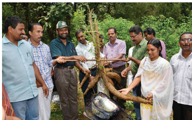
Cassava and fish harvest on the IFS day at ICAR-KVK, Peruvannamuzhi.

and house wives. The integrated farming system day was observed on 29 September 2015 at KVK and many farmers attended the programme. Stem cuttings of the cassava variety, Sree Padmanabha were distributed to farmers on the occasion.