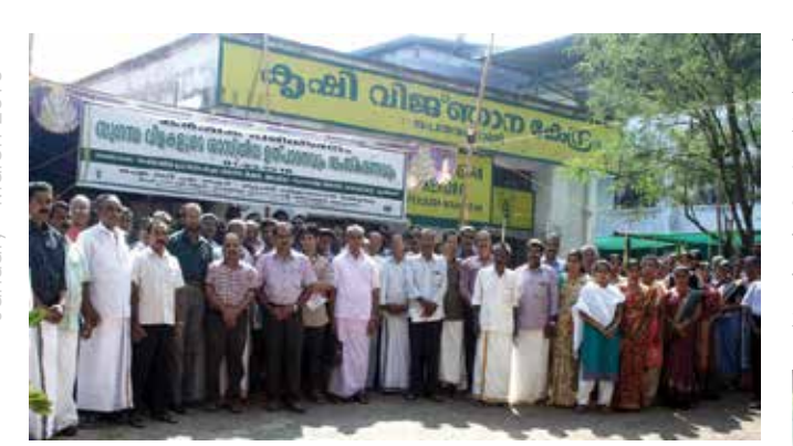
Participants of MIDH sponsored training programme on spices production technology