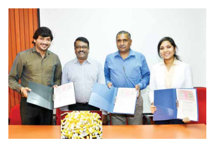
Signing of MoU for Biocapsule technology with Codagu Agritech Pvt. Ltd.

mercialization of turmeric varieties, IISR Prathibha & IISR Alleppey Supreme and ginger variety, IISR Rejatha.