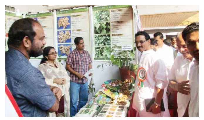
Minister of Agriculture, Govt. of Kerala, at ICAR-IISR pavilion during Organic Agri Summit

ICAR-IISR participated in the mega exhibition held in connection with the First national ATMA-SAMETI Organic Agriculture Summit at Adlux International Convention Centre, Angamaly during 7-8 January 2016. The IISR stall attracted huge interest among the delegates from various states and the general public.